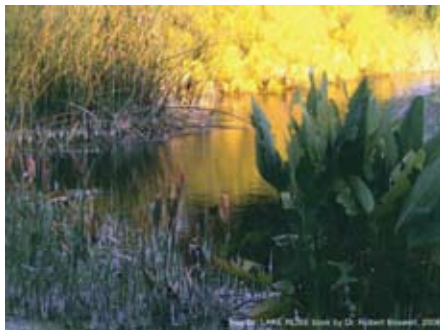
Today, Lake Rose in Winter Park Sinkhole.

Until that point, there was a good deal of literature written on the subject, however very little of it dealt with Florida. Most of the literature concerned diamond mines in South