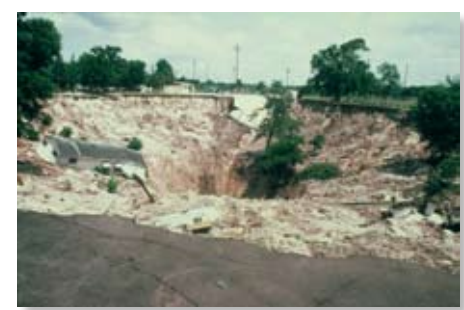
Sinkhole still growing and swallowing a house and large trees virtually intact.