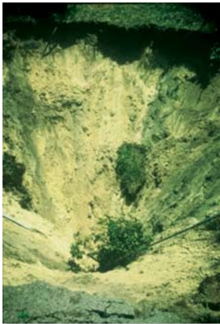
Early stages of Winter Park Sinkhole.