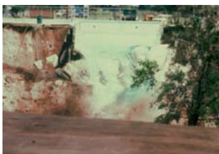
Pool fails after undermining by several feet.