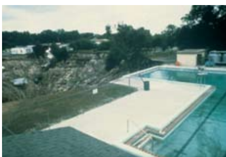
Winter Park sinkhole reaches community pool.

Many of us can try to predict, even though there are no written or verbalized set of criteria. The graphs